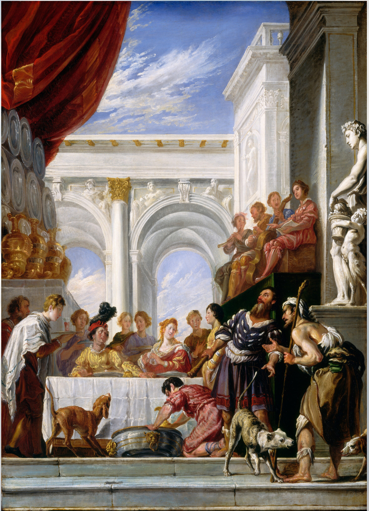
Domenico Fetti The Parable of Lazarus and the Rich Man , 1618/1628