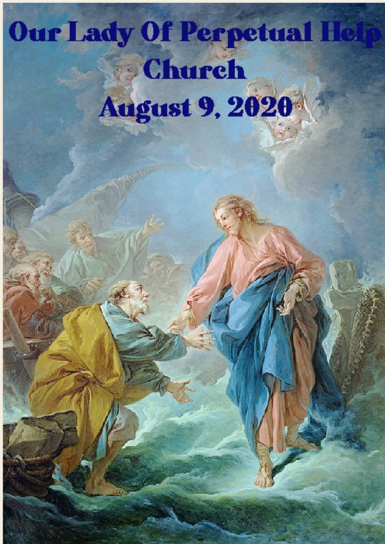
St. Peter Invited to Walk on the Water, 1766 by Francois Boucher (1703-70)