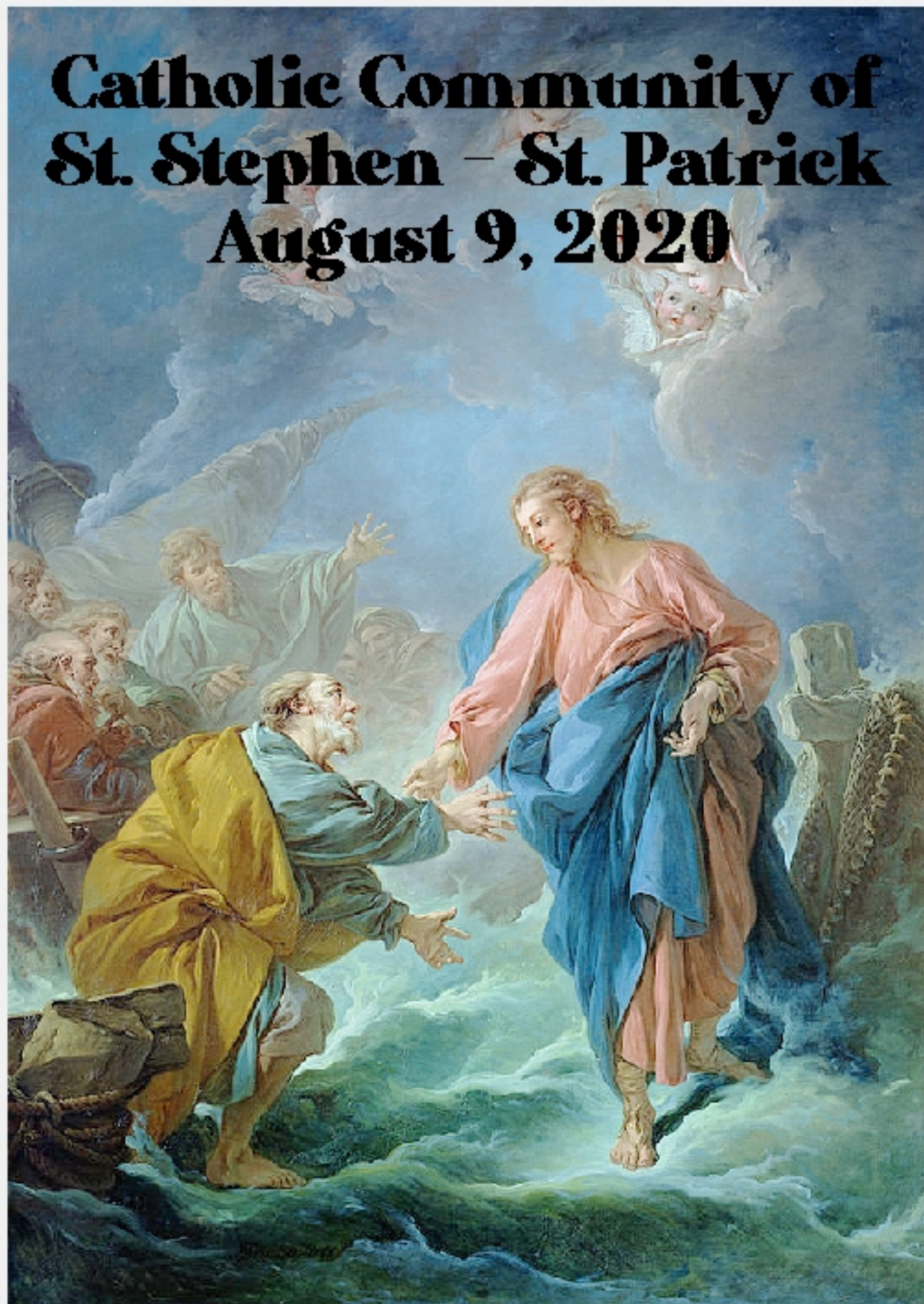
St. Peter Invited to Walk on the Water, 1766 by Francois Boucher (1703-70)