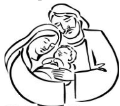
Christmas Season Schedule

The Light Is On For You -Monday, December 20 th , between 4:00pm and 7:00pm at our Whitney Point Church only.